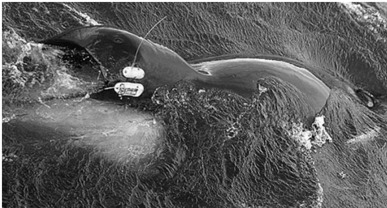
Figure 2. Keiko after arriving in Norway with the VHF tag (on top) and SDR tag (below) mounted to his dorsal fin.

For purposes of analysis, the study was divided into six periods, based on Keiko's location and contact with humans and wild killer whales (Table 1). During periods 1 and 2, Keiko was off the archipelago of Vestmannaeyjar and adjacent waters, in southern Iceland and periodically observed from a small sailboat. In order